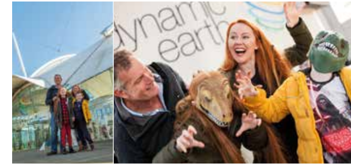
Hop off at stop 4 for family fun at Dynamic Earth