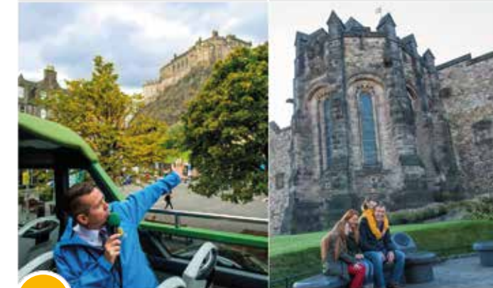
Hop off at stop 10 to visit historic Edinburgh Castle

Tell everyone about your Edinburgh Bus Tours experience and the attractions you've seen! We'd love to see your sightseeing photos. Use our free on board Wi-Fi to stay connected on the go @edinburghtour Edinburgh Bus Tours edinburghbustours