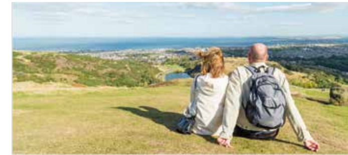
Hop off at stop 3 and climb Arthur's Seat for breathtaking views over the whole city and fantastic photo opportunities

Please spare a moment to leave us a review at edinburghtour.com/reviews