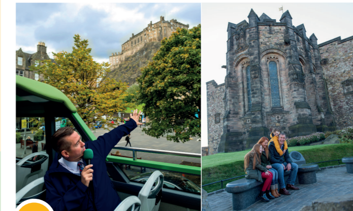
Hop off at stop 10 to visit historic Edinburgh Castle

@edinbourgtour Edinburgh Bus Tours edinburghbustours