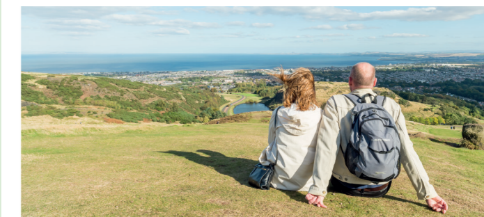
Hop off at stop 3 and climb Arthur's Seat for breathtaking views over the whole city and fantastic photo opportunities

Please spare a moment to leave us a review at edinbourgtour.com/reviews