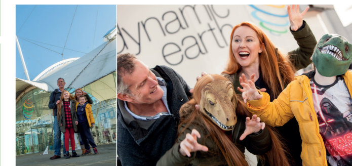
Hop off at stop 4 for family fun at Dynamic Earth